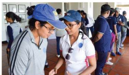
PGDip (Busi Mgmt) Programme