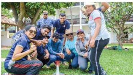
PGDip (Busi Mgmt) Programme