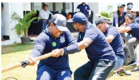
12 PGDip (Busi Mgmt) Programme