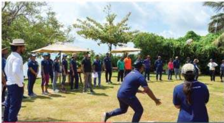
PGDip (Busi Mgmt) Programme