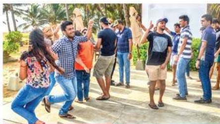
PGDip (Busi Mgmt) Programme